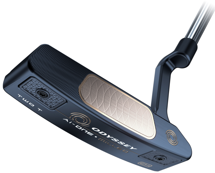
Ai-One Milled Putter