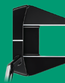
LAS VEGAS DB/H4.5